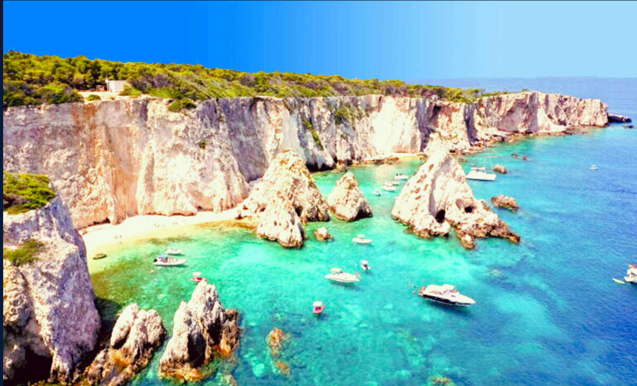
Pictured: Adriatic Sea - Tremiti Island Archipelago (Molise / Puglia)